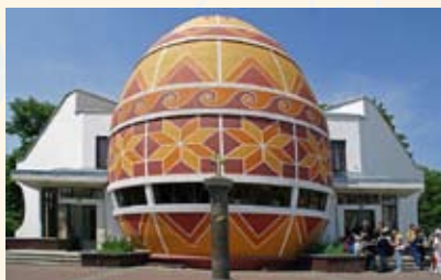
Easter Egg Museum in Kolomya (Zakarpatska Oblast), Ukraine