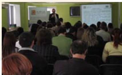
Training in Tarnopol on February 5th