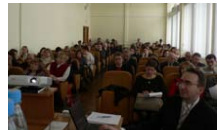
Training in Minsk on February 5th