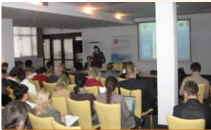
Training in Lviv on January 19th

The total attendance in Ukraine was 376 persons.