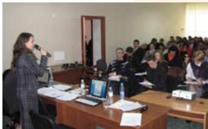
Training in Luck on January 20th

A training in Belarus was held in Minsk on February 5, 2010 in the premises of the Education Centre of the State Customs Committee, Belarus. The training was attended by 81 persons coming from the Minsk, Grodno, Brest and Homel areas. The trainings showed genuine interest in the Programme and ignited a significant volume of project applications being accepted to date.