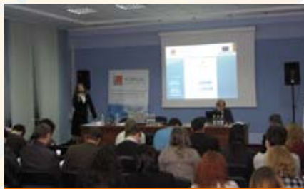
Training in Rovne on January 21th