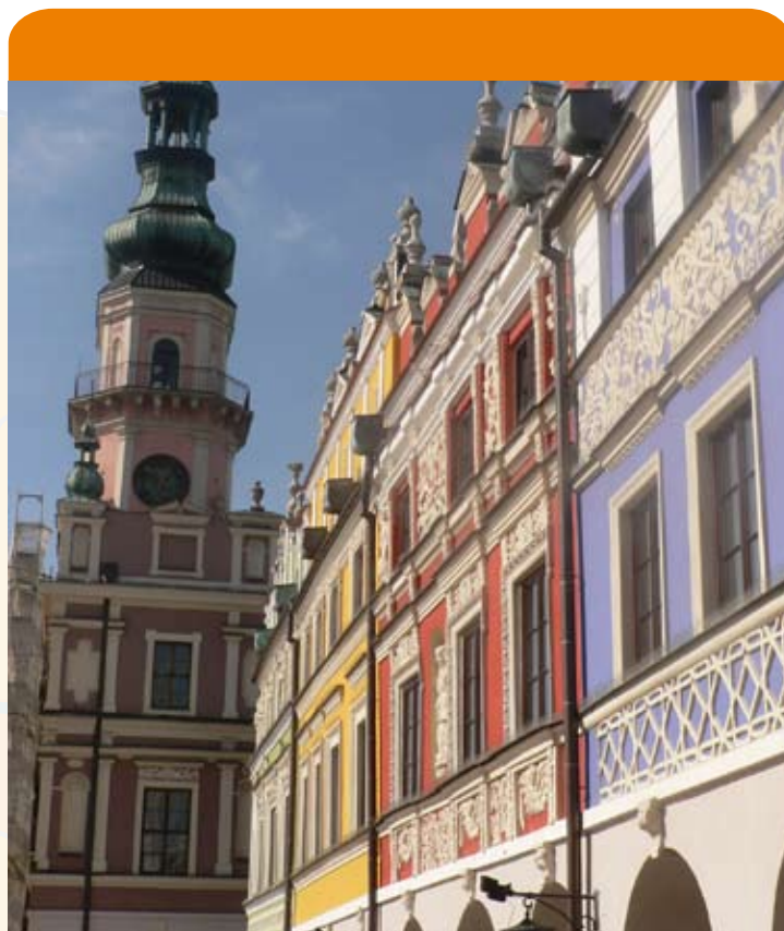
Zamość - like a colourful Eastern basket