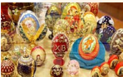
An exhibition of Easter eggs opened in Grodno, Belarus on 1 April.

The most known exhibitions of Easter eggs in Poland, Belarus and Ukraine are situated on the Programme territory. We are sure it is not a coincidence! The egg is widely used as a symbol of the start of new life, and we are sure a lot of new valuable projects will hatch out soon!