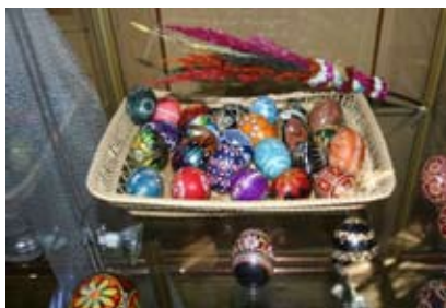
Easter Egg Museum in Ciechanowiec (Podlaskie Voiv.), Poland

The most known exhibitions of Easter eggs in Poland, Belarus and Ukraine are situated on the Programme territory. We are sure it is not a coincidence! The egg is widely used as a symbol of the start of new life, and we are sure a lot of new valuable projects will hatch out soon!