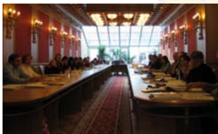
Training in Ivano Frankovsk on February 4th