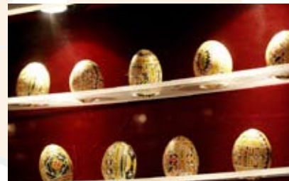
Easter Egg Museum in Kolomya (Zakarpatska Oblast), Ukraine