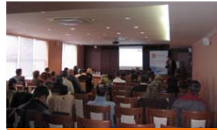
Training in Uzhgorod on February 2nd