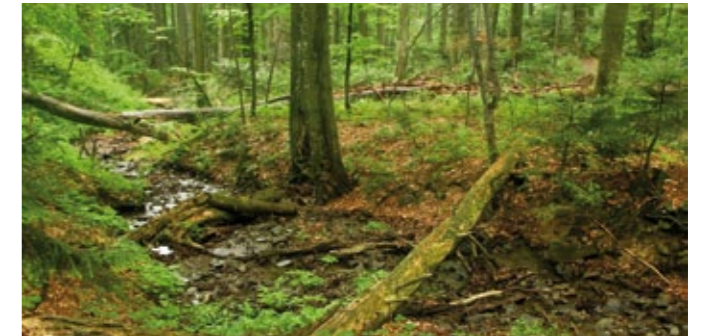
6. Primeval Beech Forests of the Carpathians (Ukraine/Slovakia)