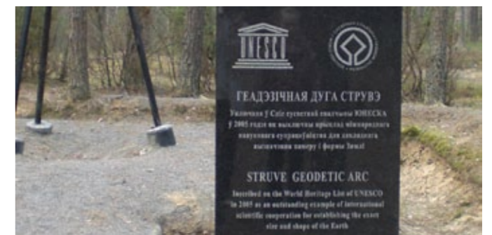
7. Struve Geodetic Arc (Belarus, Ukraine, Republic of Moldova, Norway, Sweden, Finland, Russian Federation, Estonia, Latvia, Lithuania)