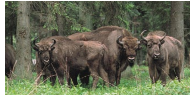
2. Virgin forests of Bielaviežskaja Pušča / Puszcza Białowieża (Belarus/ Poland)