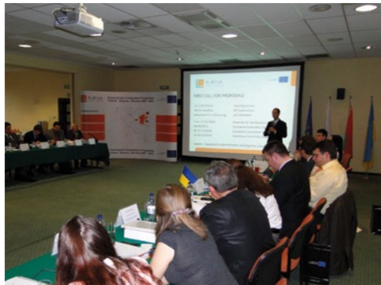
JMC meeting 23.11.2010

The Joint Monitoring Committee during its third meeting (which took place on 23-24 November 2010) decided to approve the list of 21 projects, which shall be funded within the 1st Call for Proposals. The maximum total value of the selected projects exceeds the budget allocated for the 1st Call.