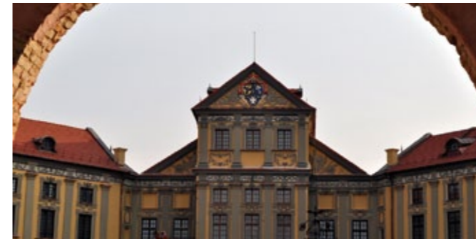
1. Architectural, Residential and Cultural Complex of the Radziwill Family in Niasviž (Belarus)

There are 8 UNESCO World Heritage Sites on the Programme territory including 3 transboundary sites. We have the pleasure to present these "gifts from the Past to the Future" (source: whc.unesco.org):