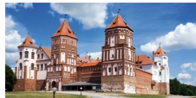
4. Mir Castle Complex (Belarus)