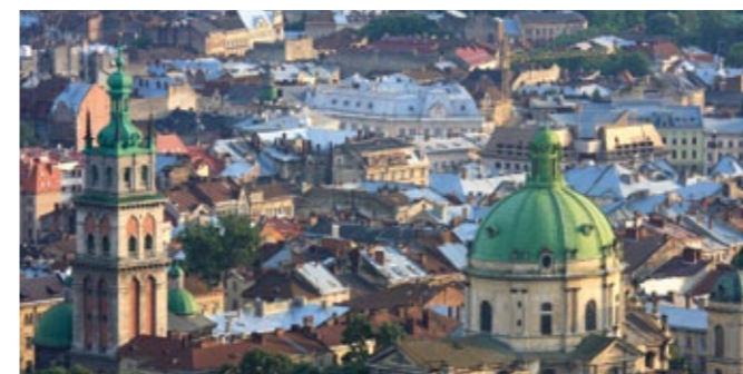
3. Lviv - the Ensemble of the Historic Centre (Ukraine)