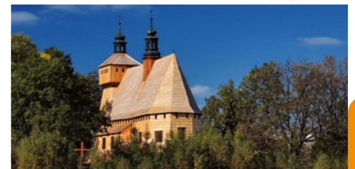
8. Wooden Churches of Southern Little Poland (Poland)