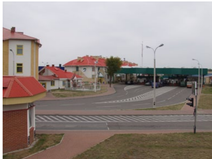
Modern and efficient border crossings are crucial for cross-border cooperation

With great pleasure we would like to inform that the Cross-border Cooperation Programme Poland-Belarus-Ukraine 2007-2013 is the first Programme among all other ENPI Programmes which has managed to successfully select the first LSPs! The European Commission approved the full application forms of two LSPs which soon will sign contracts with the Joint Managing Authority. At the same time, until now six further LSP Project Summaries were already approved by the EC and the full application forms are under preparation. The last Project Summary is under preparation.